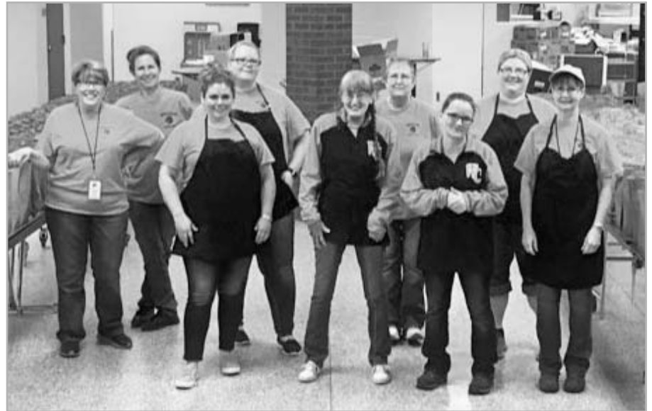
The meals staff warriors!