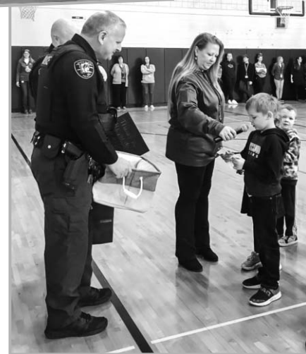
First graders receive police officer survival kits