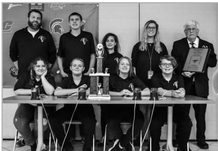
The junior varsity team