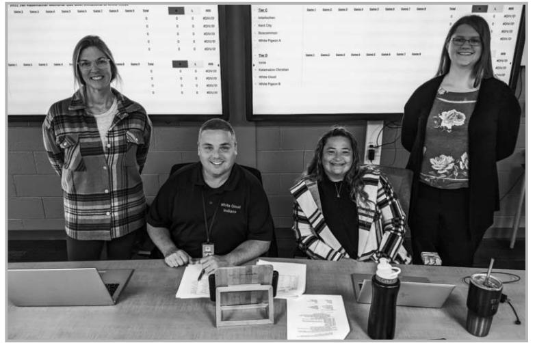
Keepers of the stats