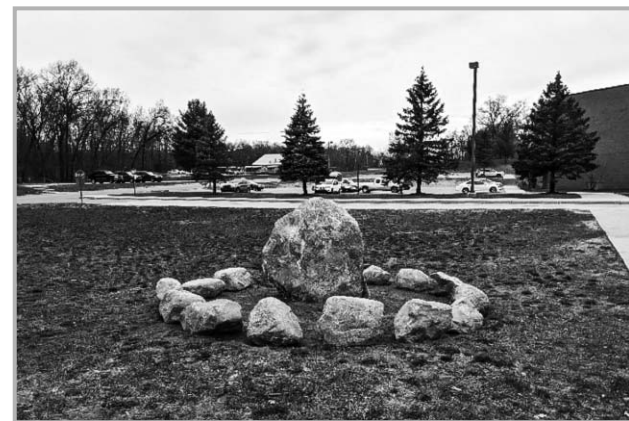
Finished installation of the unpainted Spirit Rock on April 22, 2022.

It is the hope of the class of 2021 that each successive graduating class will make their own mark on Spirit Rock. As a new tradition, Spirit Rock will serve as a symbolic, physical expression of the students' unique views and individuality for many years into the future. ■