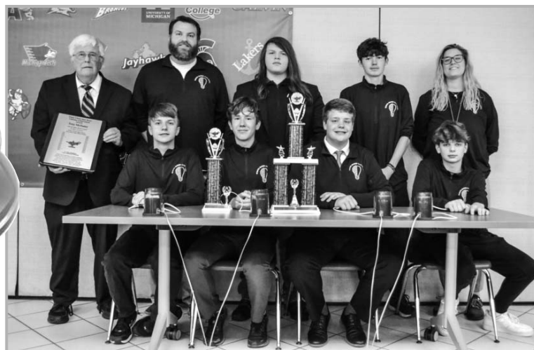
The varsity team

It was that time of year – hot cider, tasty chili, changing colors, championship baseball and, most importantly, White Cloud Quiz Bowl's very own fall classic, the Jan Rademacher Memorial Invitational.