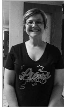
A few of our mentors:

Thank you. I look forward to seeing our mentor program grow! ■